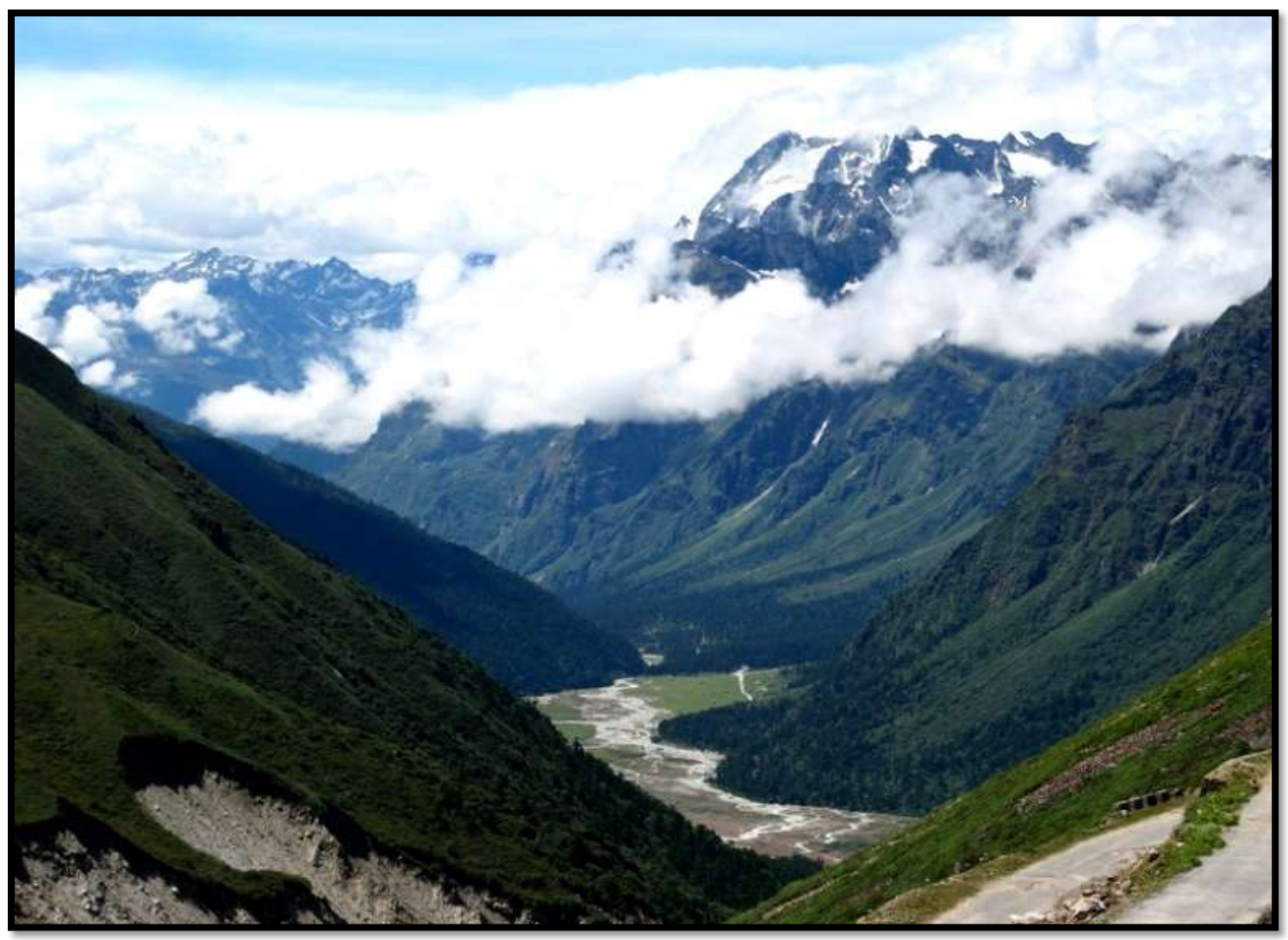
Day 4 | Mar 27 |