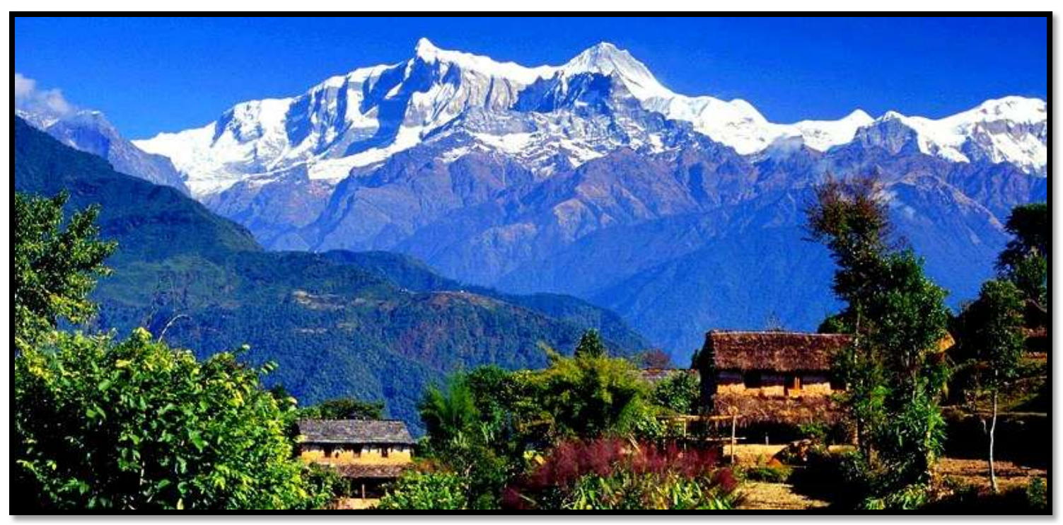
Day 1 | Mar 24 | Arrive Bagdogra Airport – Rumtek (1750 M) 125 kms / 5 hrs

Meeting and assistance on arrival and drive to reach Rumtek by early evening. Drive via Siliguri and then through the dense forests of Mahananda Wild Life Sanctuary to reach Sevok in the foothills – see gorgeous view of Tista River as it comes out from the deep gorges of the Himalayas and spreads itself over the vast plains of North Bengal. From here the drive is on winding roads along the meandering emerald green Tista till Singtham, and then through typical Sikkimese mountainside dotted alluringly with terraced land & orchards to finally reach Rumtek - a serene & undisturbed village about 20 km (40 min drive) from Gangtok. Check in to a room on arrival.